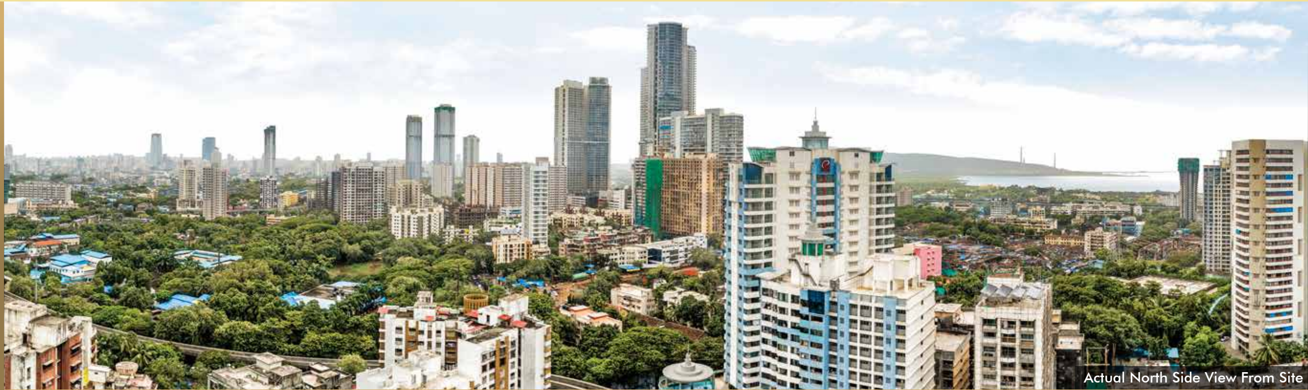
Actual North Side View From Site