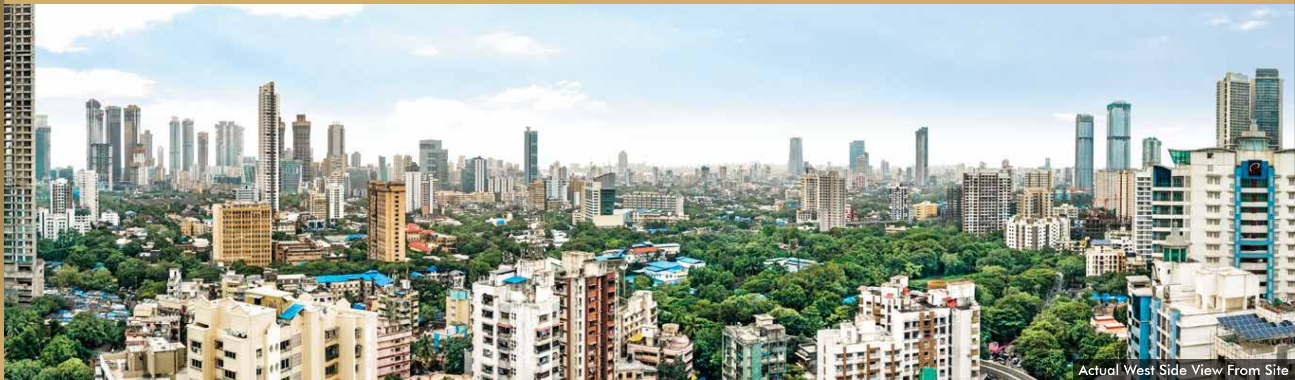
Actual West Side View From Site