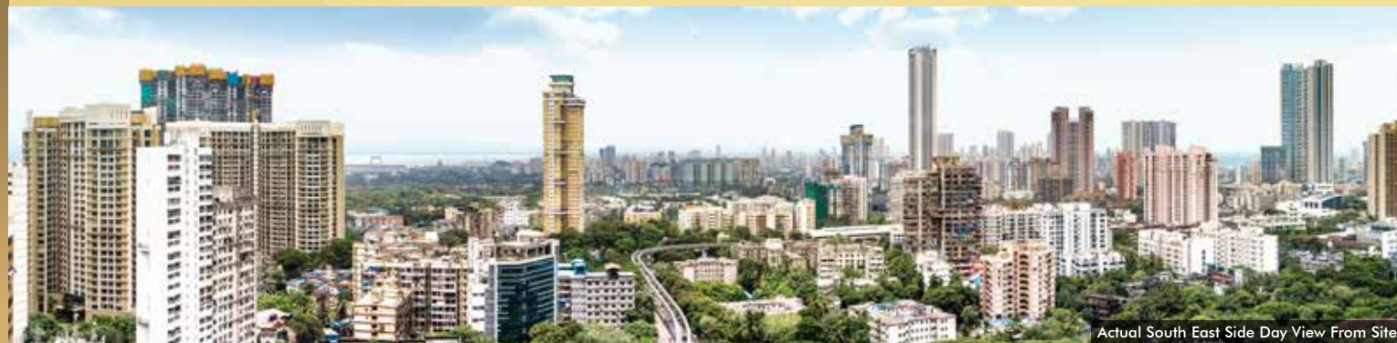
Actual South East Side Day View From Site

Ground + 2 Podium + 17 storeys | 2 & 3 BHK Apartments